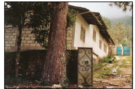
The Upper House at Kenscoff

At Kenscoff, 4,500 feet above sea level and one hour by car from Port-au-Prince, the Sisters hope to rebuild their Conference Center to better serve their volunteers, young people, old people, parishes, and all who hear Jesus' words, "Come unto me...and I will give you rest." Small and large gifts are welcome.