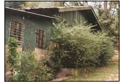
The Lower House at Kenscoff

The Foyer Notre Dame Guest House not only provides with a temporary and comfortable place to stay, but also is a source of income for the Foyer residents.