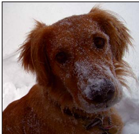
Penny isn't sure she likes this!