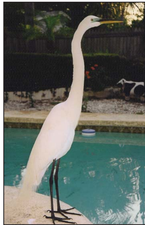
Charlie the Egret