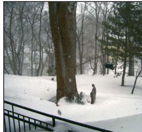
View from the Refectory- January 22, 2005