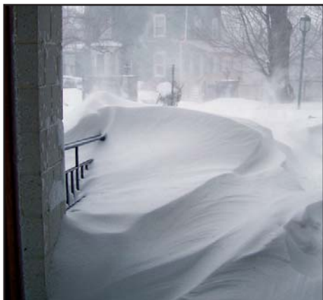
View from the Front Door- January 22, 2005