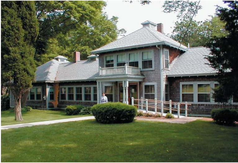
Bertram Conference Center

The Sisters of St. Margaret welcome inquiries regarding the use of our facilities in Duxbury, which offer unlimited access to our private Duxbury Bay Beach.