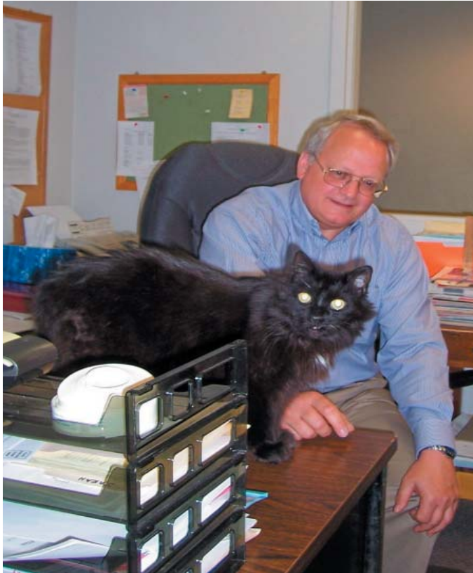
Male bonding time at St. Margaret's